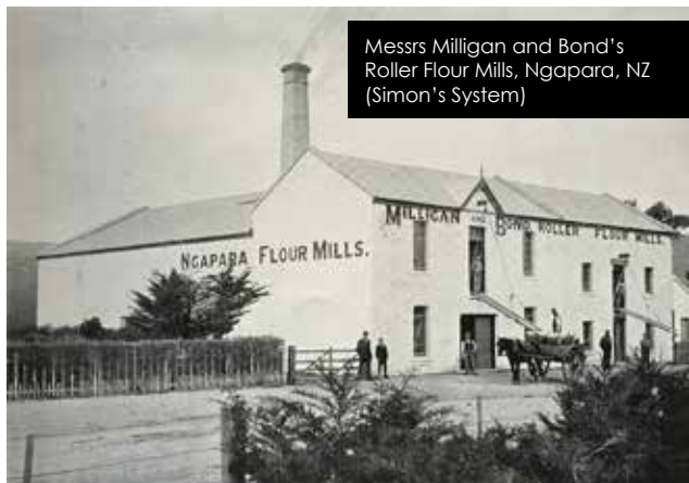
Messrs Milligan and Bond's Roller Flour Mills, Ngapara, NZ (Simon's System)