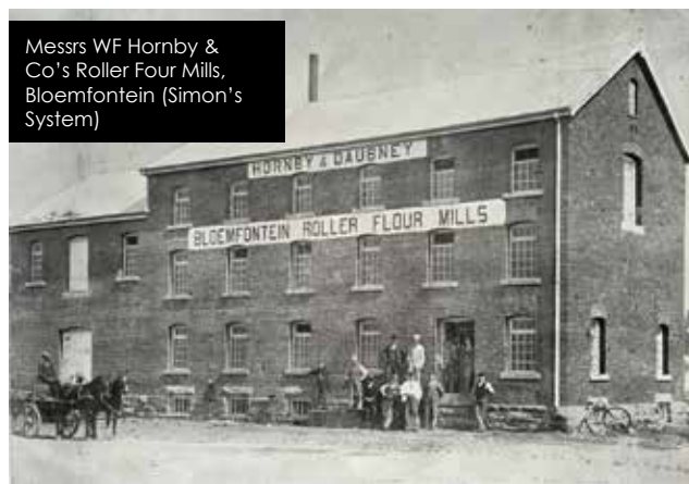
Messrs WF Hornby & Co's Roller Four Mills, Bloemfontein (Simon's System)