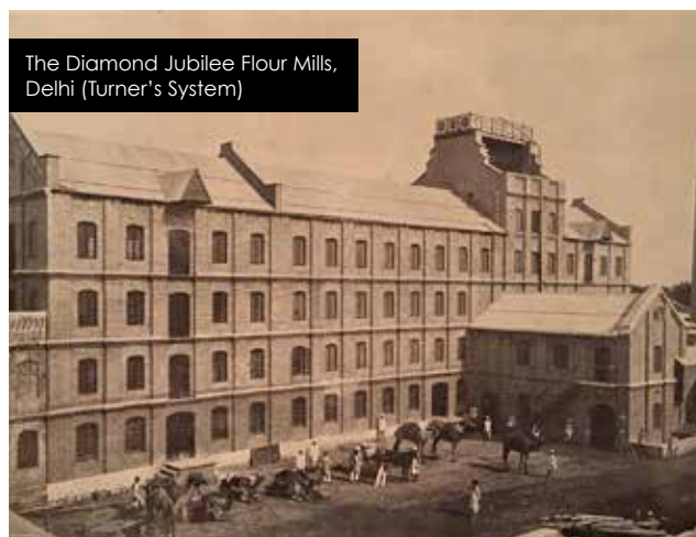
The Diamond Jubilee Flour Mills, Delhi (Turner's System)