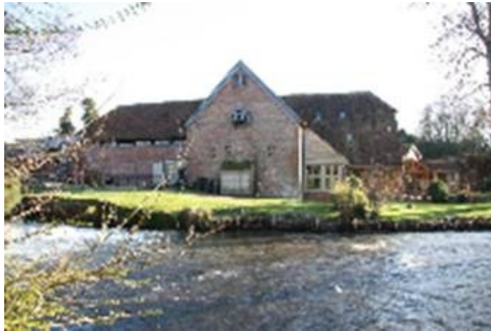
Hockley Mill

We had made several attempts before to visit this Grade II Listed Watermill near Twyford, but always managed to overshoot the tiny turning in the mistaken belief that it “couldn’t possibly be down there.” Well, that can be half the fun of finding mills and discovering their settings – for each one appears to be unique. So it was with Hockley Mill, and we weren’t disappointed for the view which opened before us as we ventured down the track was a delightful surprise.