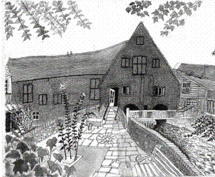
Winchester City Mill in 2013