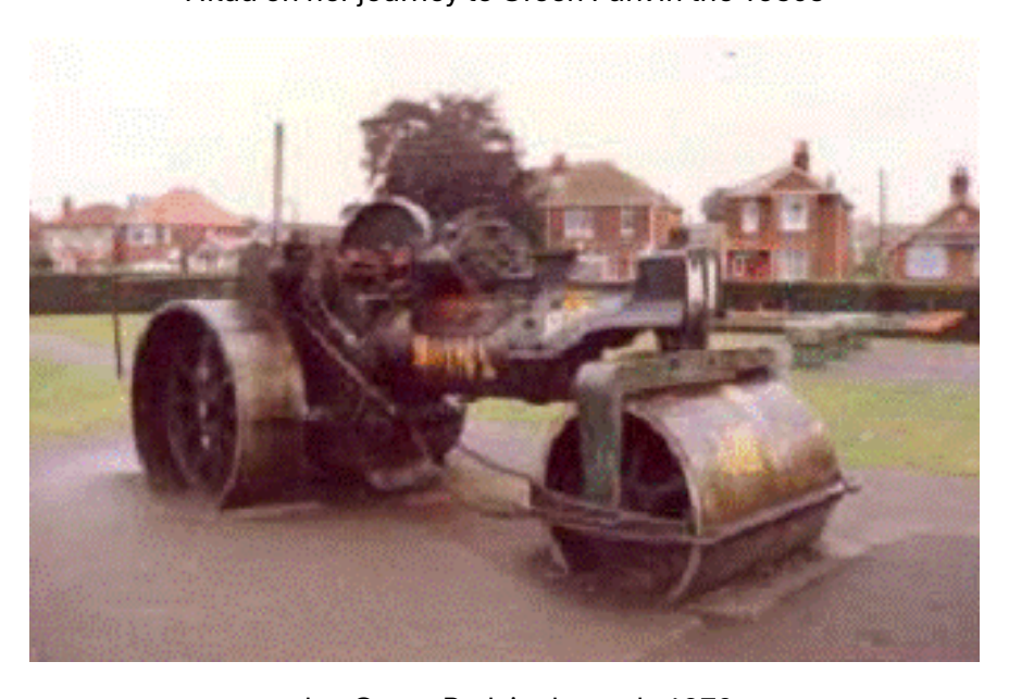
and at Green Park in the early 1970s