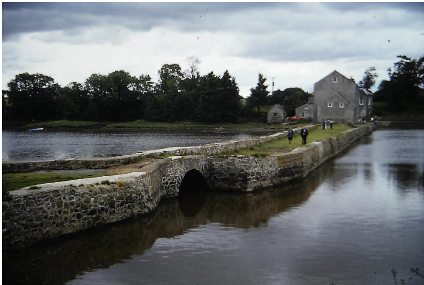
Carew Tide Mill in August 1979