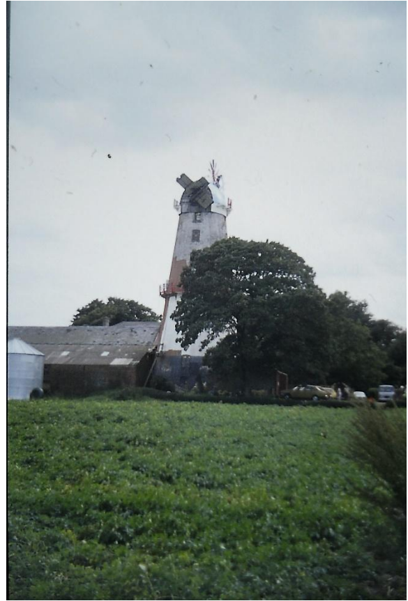
Sutton Windmill in Norfolk in August 1982