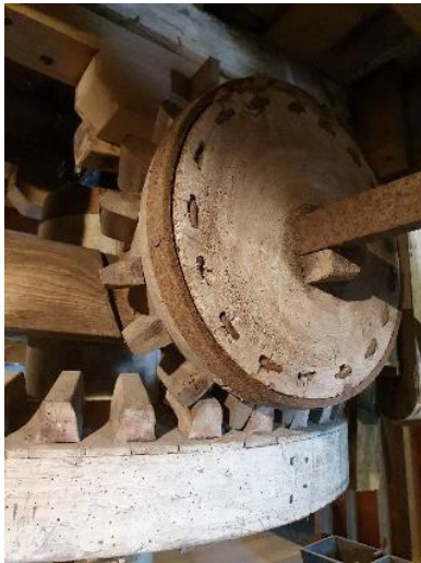
Ancillary drive on stones floor