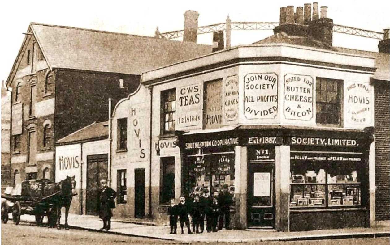
Figure 42. A photograph of the mill in 1907, when in use as a warehouse. Behind the mill can be seen part of the frame of a gasholder and one of the chimneys of the gasworks. The shop on the corner is branch No. 1 of the Southampton Co-op, with its bakery alongside.