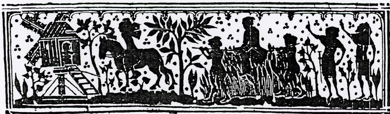
SECTION OF A BRASS IN ST. MARGARET'S CHURCH, KING'S LYNN, SHOWING THE EARLIEST KNOWN REPRESENTATION OF A WINDMILL