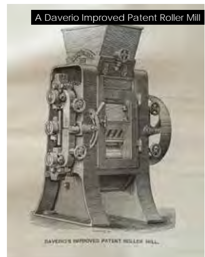
A Daverio Improved Patent Roller Mill