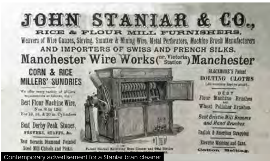
Contemporary advertisement for a Staniar bran cleaner

The wheat bins were all ventilated by perforated zinc plates which let in on each side to allow fresh air to play upon the grain, keeping it much sweeter. On each floor