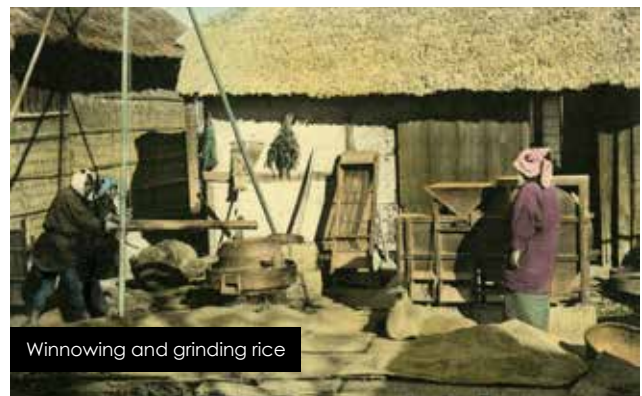
Winnowing and grinding rice