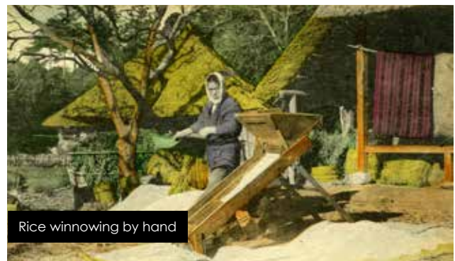
Rice winnowing by hand

Unmilled rice, known as paddy (Indonesia and Malaysia: padi; Philippines, palay), was usually harvested when the grains had a moisture content of around 25 percent. In most Asian countries, where rice was almost entirely the product of small farms, harvesting was carried out