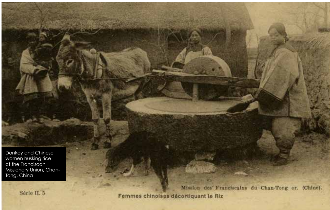
Donkey and Chinese women husking rice at the Franciscan Missionary Union, Chan-Tong, China