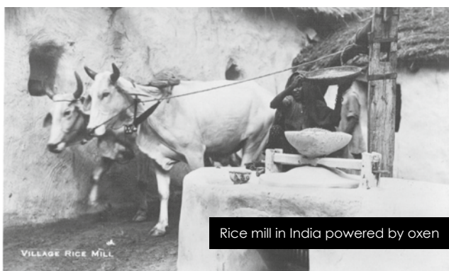
Rice mill in India powered by oxen