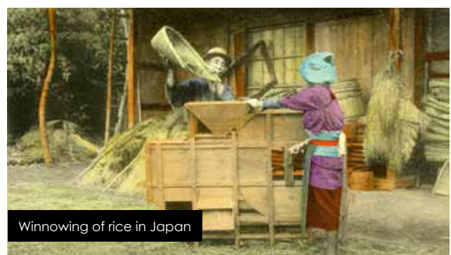
Winnowing of rice in Japan