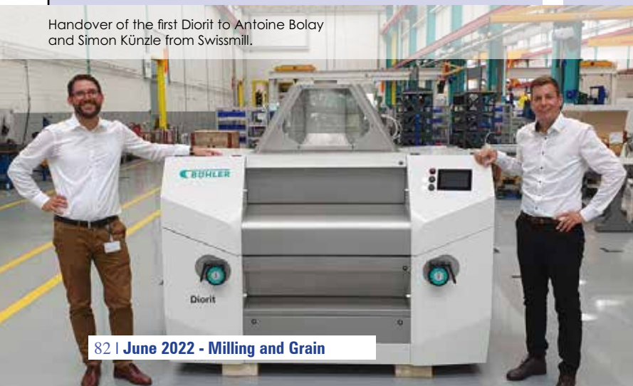
Handover of the first Diorit to Antoine Bolay and Simon Künzle from Swissmill.

Prior to the most important step for modernising the two mills - namely exchanging the roller mills - the 72 drives of both mills were upgraded with energy-efficient motors and specially designed motor suspensions. The