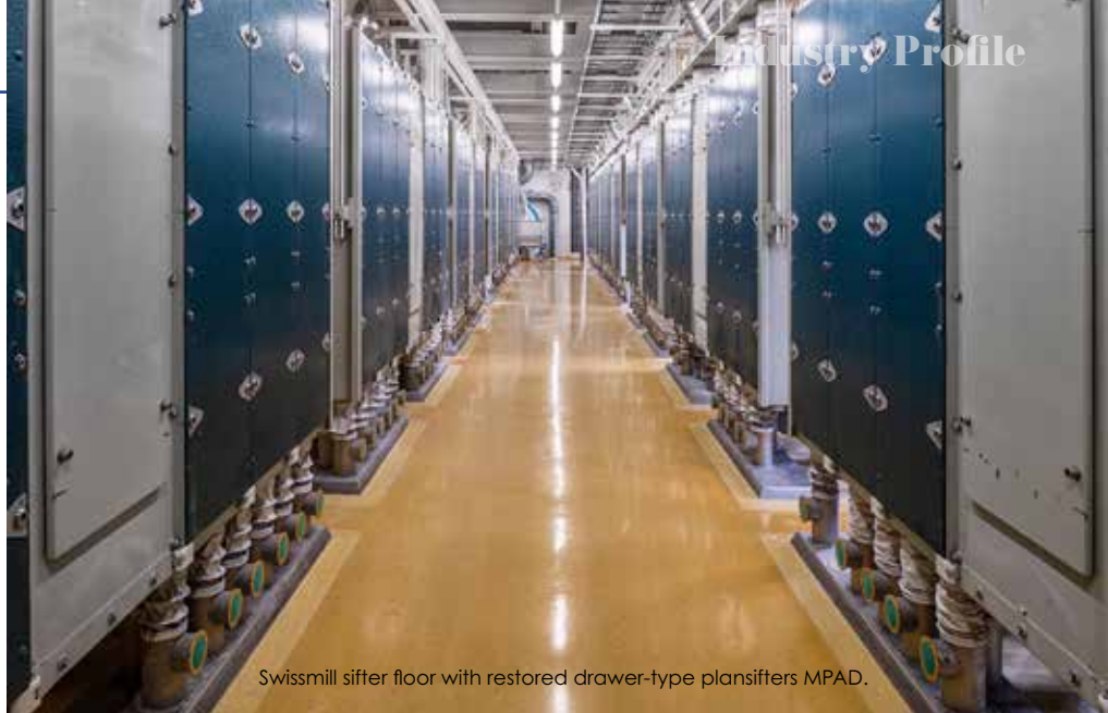
Swissmill sifter floor with restored drawer-type plansifters MPAD.

new suspensions make it possible to replace defective motors in the shortest possible time and with a minimum of personnel.