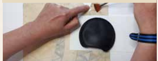
Wheat starch paste is the adhesive – a product of the milling industry enabling us to preserve its history!