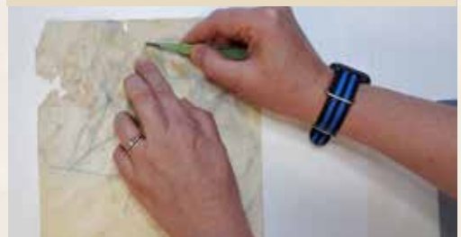
Gaps in the paper are filled in with a very pure quality, thin and strong Japanese paper made from long fibred mulberry pulp.