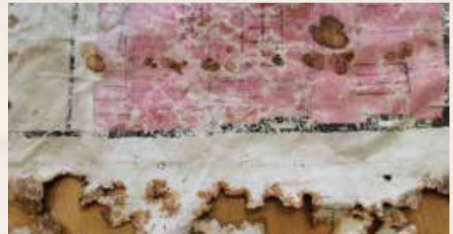
An example of the type of damage sustained by some of the drawings due to their years of storage in a garden shed.

Thanks to a grant from the National Manuscripts Conservation Trust we were able to fund cleaning and repair work by a professional library and archive conservator, Victoria Stevens. Her pictures show the process of repair and conservation.