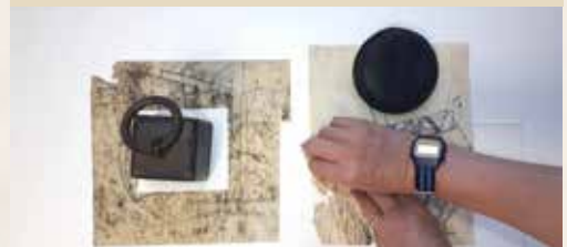
Conservator Victoria Stevens cleaning mould and dirt from the surface of two drawings.