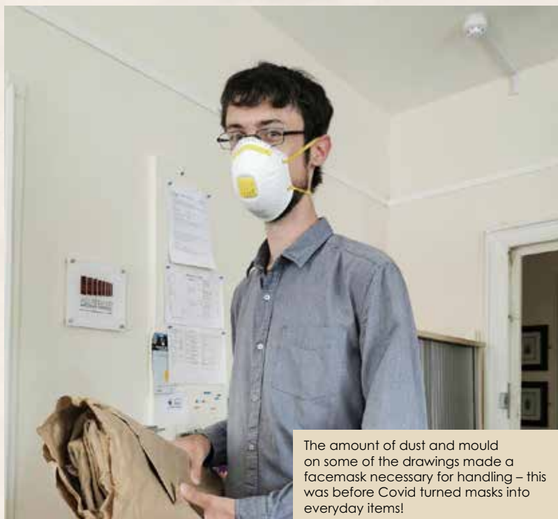
The amount of dust and mould on some of the drawings made a facemask necessary for handling – this was before Covid turned masks into everyday items!