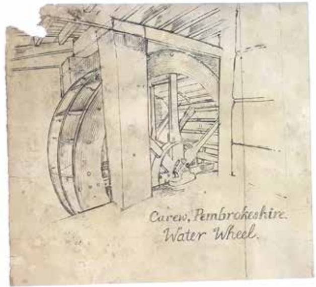
One of the drawings before and after conservation. This shows the corn mill in Carew, Wales, which was powered by the tides (and is still maintained as a visitor attraction).